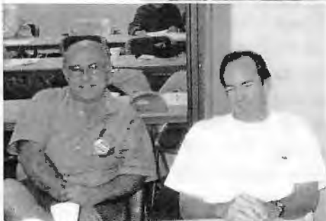
When do we eat?