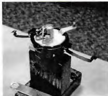
This is a distributor!!